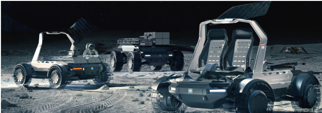
Figure 1. The Lockheed Martin Lunar Mobility Vehicle (LMV) enables unprecedented exploration of the Moon with autonomous, telerobotic, and manual operation. 1

The MILO Space Science Institute (MILO) actively seeks collaborations with international partners based on their unique capabilities and mutual scientific goals to participate in a Lunar science rideshare mission, Luna Ride . MILO will work with respondents who are interested in deploying payloads to the surface of the Moon on the Lockheed Martin Lunar Mobility Vehicle (LMV; Figure 1). 1 The Luna Ride mission will include transportation, communication, support for survivability, and deployment of payloads onto the lunar surface. We seek responses and indications of interest from nations or organizations with mature space flight heritage as well as from those with relatively new, and perhaps growing, space agencies and/or ecosystems. The MILO Project Office supports mission concept design and operations, identification of science objectives, and access to test facilities and subject matter experts with deep space mission experience to minimize risk. Luna Ride offers respondents the opportunity to advance lunar surface science, demonstrate science-focused engineering capability, and grow regional space capacity through access to hands-on instrument development, test, and operations.